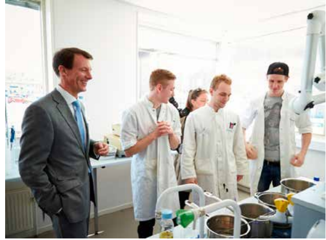
On 21 April, Prince Joachim visited the business school Tradium at HTX Teknisk Gymnasium in Randers.