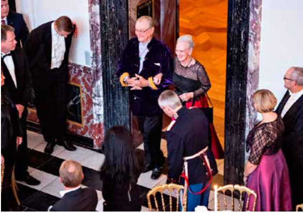
On 10 November, The Queen and The Prince Consort hosted the Fredensborg concert.