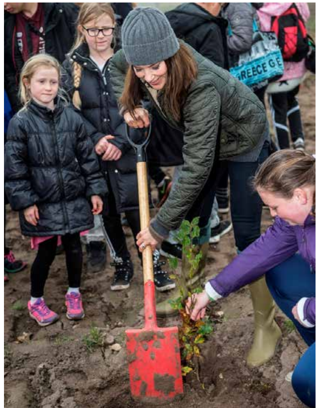
The Crown Princess planted trees with school students as a part of "Replant the Planet".

On 23 April, The Crown Prince was in charge of the opening of the knowledge and conference centre Green Solution House in Rønne on Bornholm. Green Solution House is a sustainable building - the former Hotel Ryttergaarden. The goal of Green Solution House is to create a physical platform