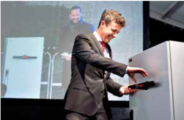
The Crown Prince presided together with HRH Crown Prince Haakon of Norway over the official opening of the new undersea cable between Norway and Denmark.

On 26 September, Princess Benedikte attended the 325th jubilee of the Royal Mews. The day was celebrated with the driving of selected carriages through Copenhagen's streets and concluded with a jubilee show at Christiansborg Riding Ground. The Royal Mews originally functioned as a stud where horses of the noblest breeds were bred for the Royal Danish House. The horses were used for riding and hunting and as carriage horses for teams to pull the royal coaches. Today, the horses of the Royal Mews are used in connection with official events such as state visits, New Year's levees, ambassador receptions, summer cruises, birthdays, anniversaries, etc.