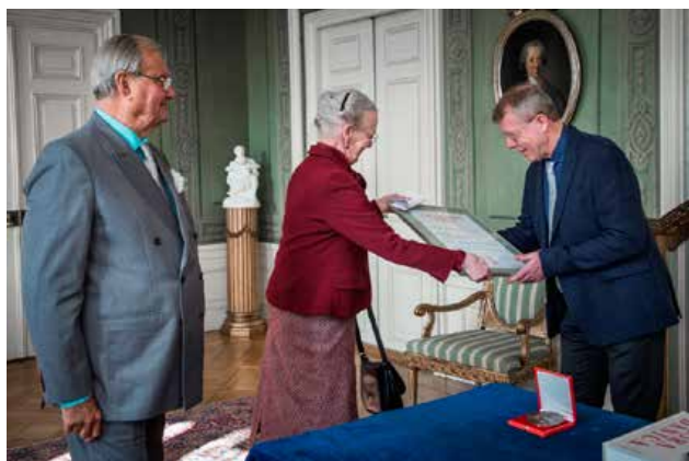
The Queen and The Prince Consort awarded the Amalienborg Prize and the Amalienborg Medal at Fredensborg Palace.