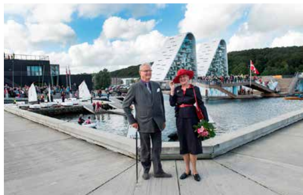
The Queen and The Prince Consort's visit in Vejle on 2 September concluded at Vejle Marina.