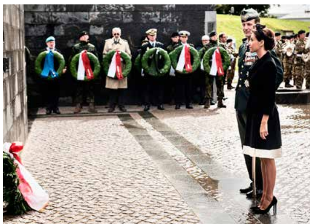
Prince Joachim and Princess Marie took part in the 5 September wreath-laying ceremony at The Citadel, Copenhagen.

In connection with the commemoration of the flag day for Danes officially serving in other countries on 5 September, Prince Joachim and Princess Marie visited with Danish Emergency Management Agency personnel stationed abroad and afterwards participated in a service at Holmen Church, a memorial ceremony and wreath-laying at The Citadel in Copenhagen.