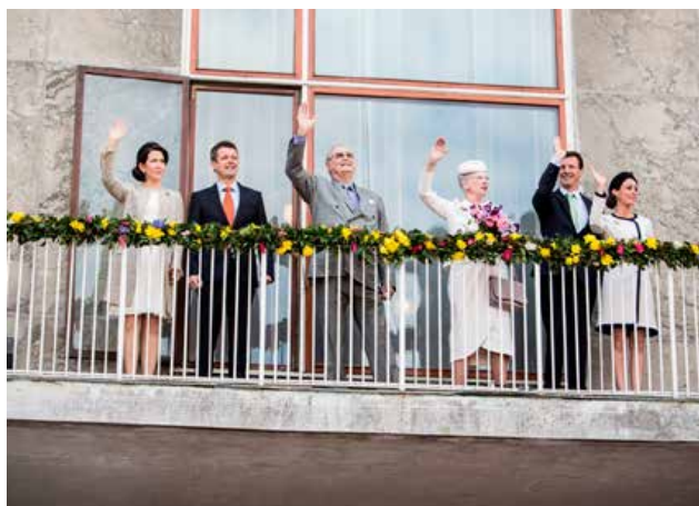
The royal family appeared on the balcony at Aarhus City Hall.