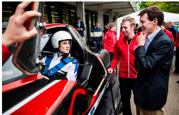
Prince Joachim was introduced to DTU's car, which won the Shell Eco-marathon 2014.