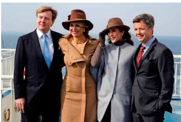
On 18 March, the Dutch Royal Couple paid a visit to Samsø together with the Crown Prince Couple.

When The Queen and The Prince Consort paid a state visit to Indonesia from 21-24 October, it was the first time a Danish sovereign paid a state visit to the country. The visit took place on the 70th anniversary of Indonesia's independence and the 65th anniversary of the establishment of diplomatic relations with Denmark, which underlined the close Danish-Indonesian