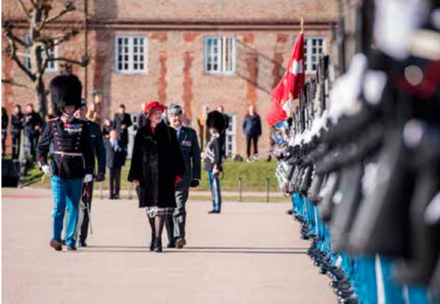
The Queen viewed a parade by the Royal Life Guard and presented "The Queen's watch".