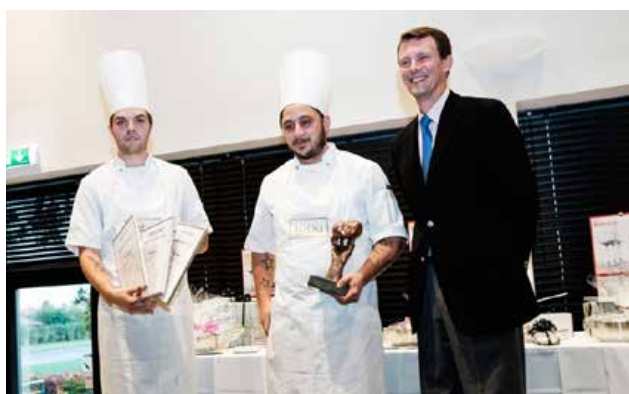
Prince Joachim presented "The Potato Prize 2015" to winners from Restaurant Tabu in Aalborg.

On 13 May, Prince Joachim participated at The Medal Fund for the Confederation of Danish Industry and Craftsmanship in East Jutland's medal presentation at Aarhus City Hall. Later in the year, on 9 September, the Prince took part in the opening of the NordBau Fair in Neumünster, Germany, and gave the opening speech. The NordBau Fair is a trade fair with approximately 900 exhibitors involved in industry and skilled trades wanting to create contacts and knowledge-sharing among people in the field. Prince Joachim's participation marked Denmark's 40th anniversary as a partner of the NordBau Fair. In his role as patron, the Prince visited the World Championship 2015 in ploughing in Thisted on 3