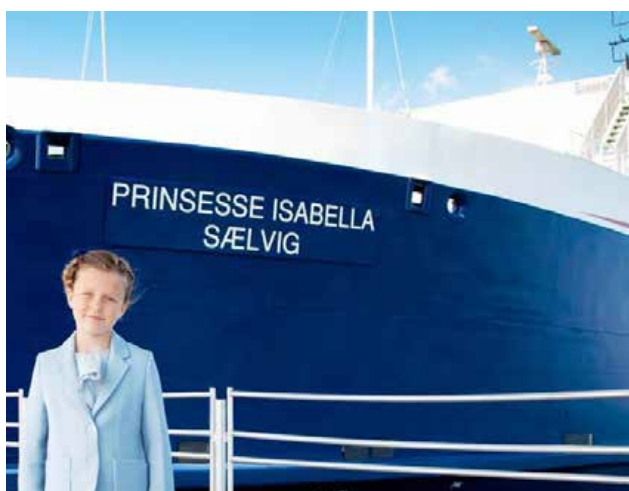
Princess Isabella at the christening of the ferry PRINSESSE ISABELLA on Samsø.

Later in the year on 2 November, The Crown Princess was present for the starting signal of the Plant a Tree campaign "Replant the Planet" at Herstedhøje Nature Centre, Albertslund. "Replant the Planet" is a climate project that was launched by the organization Skoven i Skolen og Udeskolen, and the objective is to make children more conscious of nature and the climate. In connection with the project, schoolchildren across the country are invited to plant trees for a better climate in the future, and 120 students took part in the event.