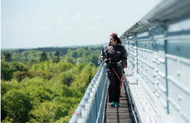
On 10 May, The Crown Princess opened Bridgewalking on the old Lillebælt Bridge, from which there is a view of Fredericia and Middelfart as well as the new Lillebælt Bridge.