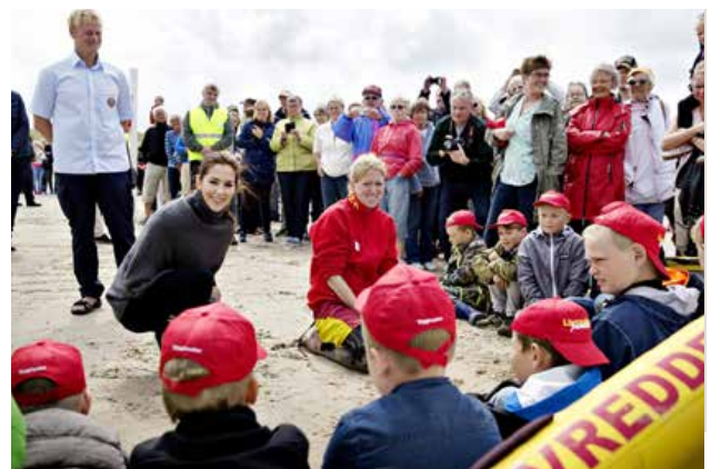
The Crown Princess spoke with the students from Tversted Skole.

As patron, HRH Princess Benedikte attended the opening of Esbjerg og Omegns Rideklub's international equestrian vaulting meet on May 29.