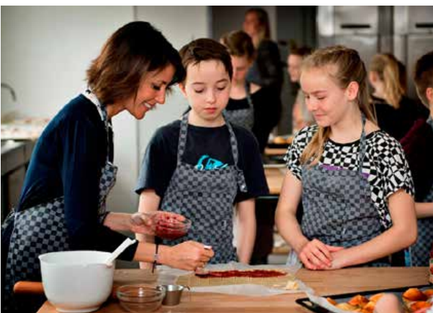
Princess Marie baked raspberry pastries with a 4th year school class.

On 6 March and 6 October, The Crown Princess, as patron, took part in meetings with the Women Deliver Committee in Copenhagen and, on 1 September, in a networking event relating to Women Deliver at the Ministry of Foreign Affairs. From 22-23 March, The Crown Princess participated in meetings as a member of the High-Level Task Force for the ICPD (International Conference on Population and Development) in New York, USA, and in activities connected