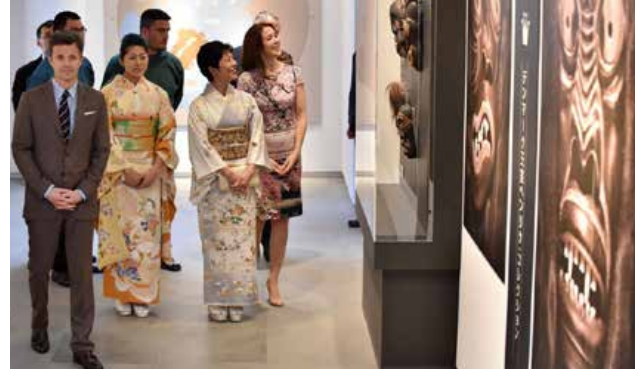
The Crown Prince Couple are shown around the exhibition "Spiritual Greenland".

The Crown Prince Couple paid a visit to Tokyo, Japan, from 26-28 March to lead a campaign promoting Greenland. The objective of the visit was to increase the knowledge about Greenland, Greenlandic culture and Greenlandic products in Japan and, at the same time, increase the knowledge the Japanese have about opportunities in Greenland and the Arctic region. Climate change and the growing international interest in the Arctic region have also generated increased interest in Japan about the Arctic and Greenland, and Japan