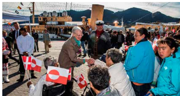
The Queen and The Prince Consort greeted the townspeople who turned out at the harbour in Qasigiannuit.