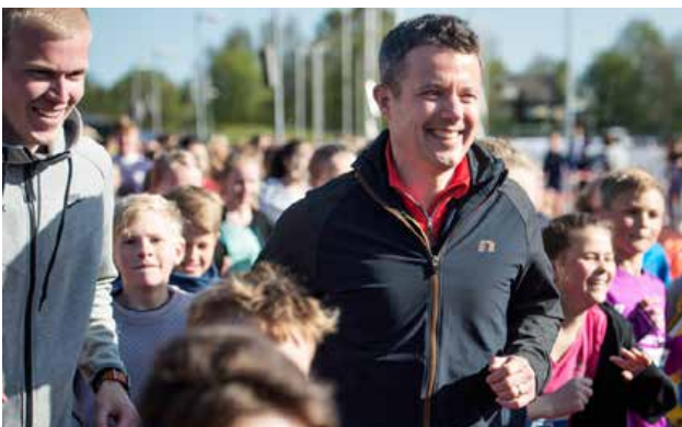
The Crown Prince took part in the warm-ups at a local School Olympic Games meet.

During the year, The Crown Prince was also present at events connected to the nationwide School Olympic Games, where school classes can qualify at 17 local athletic meets spread