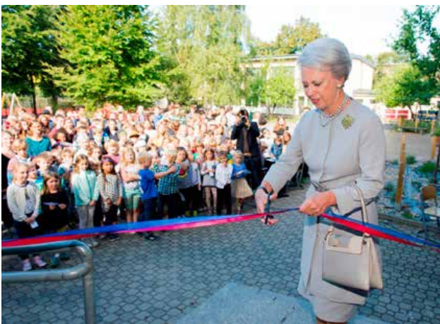
On 15 September, Princess Benedikte paid a visit to the German-Scandinavian school in connection with the visit in Berlin, Germany.

On 19 June, The Crown Princess visited the exhibition Danish Fashion Now at Brandts in Odense, which displayed a snapshot of Danish fashion and how fashion touches and influences everyday life. The exhibition also included a