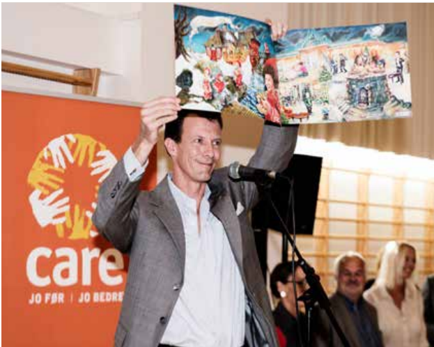
Prince Joachim launched Børnenes U-landskalender 2015.