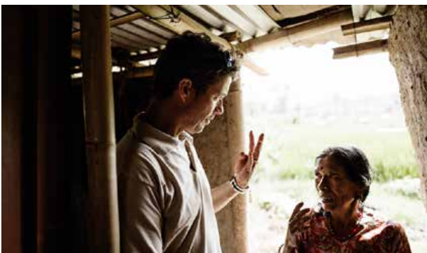
The Crown Prince visited the local people in an earthquake-stricken area and here tells about his four children.