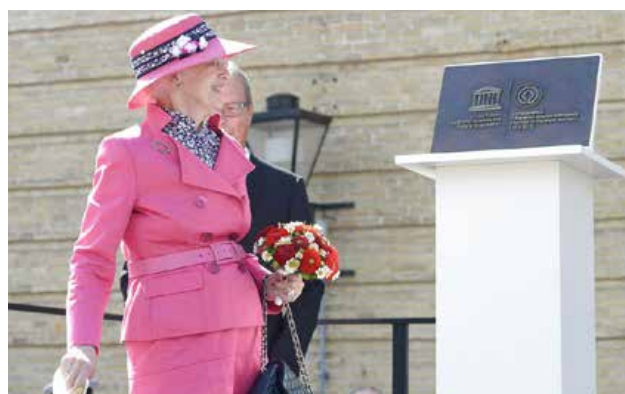
The Queen visited Christiansfeld on 29 August on the occasion of the town's inclusion on UNESCO's World Heritage List.

Princess Marie opened the Mind Factory by Ecco in Tønder on 17 February and gave the opening speech. Mind Factory is a new centre for innovation established by the company ECCO Sko A/S in cooperation with Tønder Municipality and local educational institutions. The objective of the innovation centre is to inspire and boost young people and business life into creativity and new thinking. On 16 November, the Princess gave the opening speech at "Global Entrepreneurship Week" at the House of Industry in Copenhagen, which focused on promoting and developing the passion for entrepreneurship across the whole country.