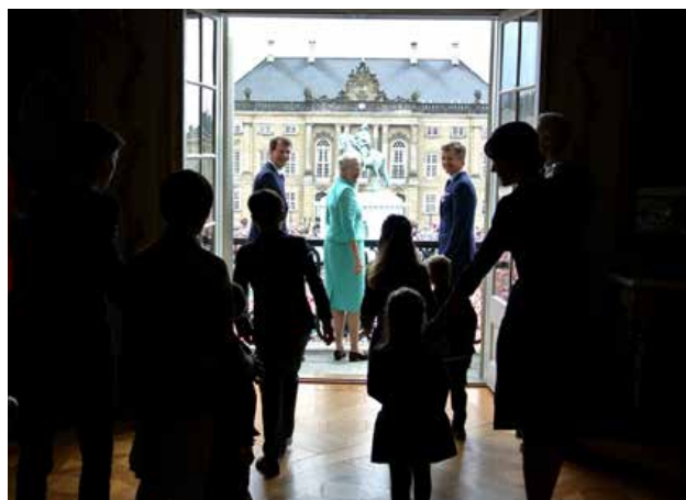
The royal family on their way to the balcony at Christian VII's Palace, Amalienborg.

On the birthday, April 16, there was first the traditional Danish morning wake-up ceremony for The Queen at Fredensborg Palace. Later in the day, the royal family appeared on the balcony at Christian VII's Palace, Amalienborg, after which The Queen and the Crown Prince Couple rode in a carriage from Amalienborg to Copenhagen City Hall accompanied by the Guard Hussar Regiment. At Copenhagen City Hall, the royal family participated in a luncheon, and, in the evening, The Queen held a gala dinner at Fredensborg Palace.