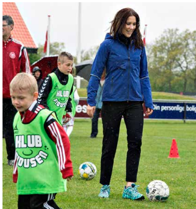
On 12 May, The Crown Princess took part with The Mary Foundation in a Klubfidus event at AaB.