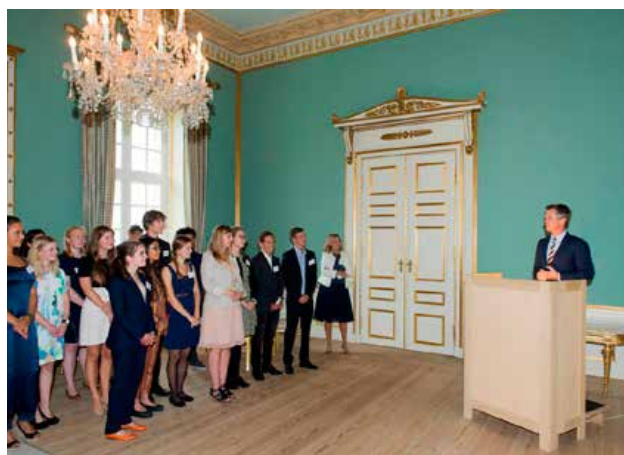
The Crown Prince speaks in connection with the award ceremony of United World Colleges Achievement, which took place in Frederik VIII's Palace at Amalienborg.

On 8 May, The Queen and The Prince Consort were present at the Technical University of Denmark's anniversary celebration and, on 20 November, The Queen and The Prince Consort were present at the University of Copenhagen's anniversary celebration.