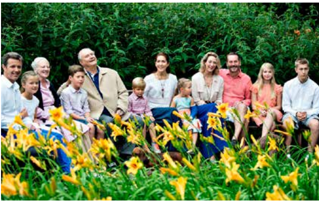
On 25 July, the royal family members present posed for a photograph in connection with the family's stay at Gråsten Palace.