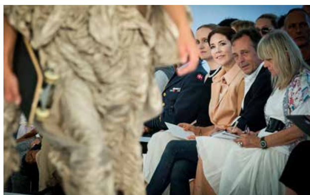
On 7 August, The Crown Princess attended the Designers' Nest fashion show.

The Crown Princess participated in the Young Global Leaders' Day on 28 August at Christiansborg Palace and, in the evening, hosted a buffet dinner for Young Global Leaders (YGL) Scandinavia at Frederik VIII's Palace, Amalienborg. Young Global Leaders is a global community of the world's most outstanding young leaders. The Crown Princess was named a Young Global Leader in 2012 on the basis of The Crown Princess's work in the field of social matters, including