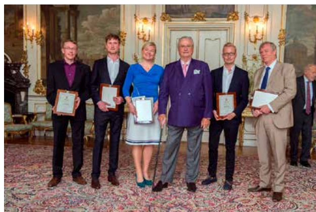
The Prince Consort awarded prizes from HRH The Prince Consort's Foundation at Fredensborg Palace on 11 June.