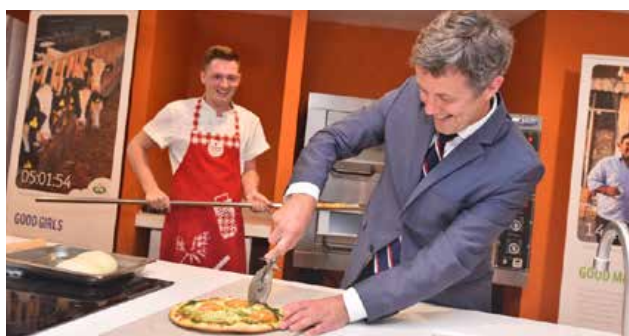
The Crown Prince took part in food preparation during the opening of Arla Foods' new office in Kuala Lumpur, Malaysia.

From 19-21 May, the Crown Prince Couple visited Hamburg and Munich in Germany to lead a Danish business delegation with 75 participating companies. The visit's overall theme was Danish Living/Dänisches Leben, which focused on the following sectors: Sustainable Living, Healthy Living, Tasty Living and Stylish Living. Both in Hamburg and Munich, the Crown Prince Couple took part in the opening of business seminars and paid visits at four sector seminars. The Crown Prince Couple also participated in business luncheons and gala dinners for the participating companies and their guests and a number of company visits in Hamburg and Munich, among others Carlsberg, ECCO, Georg Jensen and Fritz Hansen.