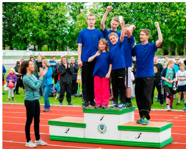
Princess Marie took part in Specialskolernes Idrætsdag at Aabenraa Stadium.

In connection with her engagement in Girl Guide and Girl Scout life, Princess Benedikte participated in a number of meetings and activities throughout the year. On 5 March, the Princess held a meeting of the Committee for Support of International