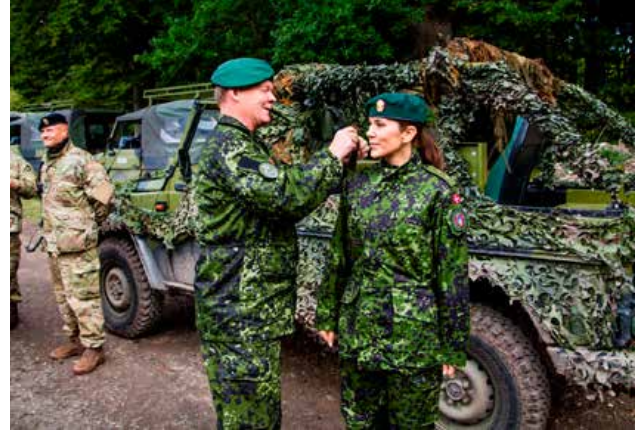
The Crown Princess is promoted to first lieutenant.