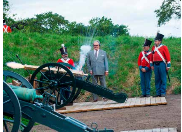
The Prince Consort dedicated a 3-pounder cannon with the firing of a shot at The Princess's Bastion in Fredericia.