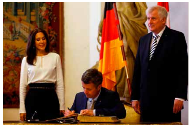
The Crown Prince Couple signed the guestbook at the castle Residenz in Munich in connection with a business promotional campaign in May.

During the visit, the Crown Prince Couple opened an exhibition in Tokyo about Greenlandic culture together with Their Imperial Highnesses Princess Takamado and Princess