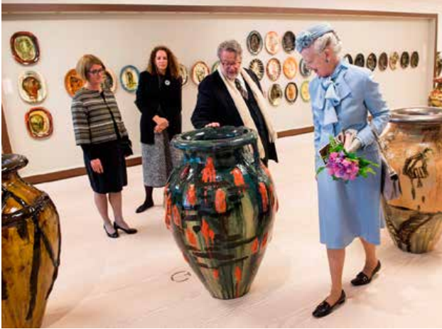
The Queen was present at the 19 May opening of CLAY Museum of Ceramic Art Denmark.