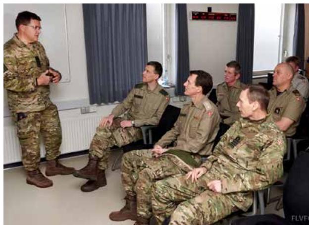
On 18 January, Prince Joachim participated in a briefing in Karup at the Danish Defence's Transportation Office in connection with the Prince's new position in the Defence