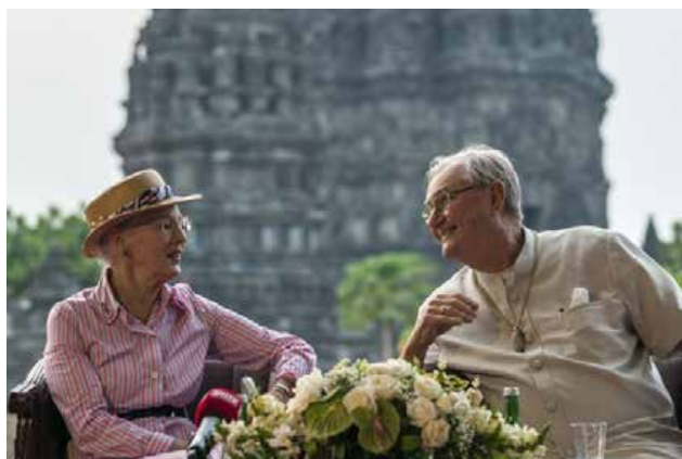
The Queen and HRH The Prince Consort paid a state visit to Indonesia from 22-24 October.

During the year, a number of foreign political leaders, et al. were in audiences with The Queen, including the president of Estonia, NATO's Secretary General, the Coptic Orthodox Pope, and Germany's chancellor, Angela Merkel.