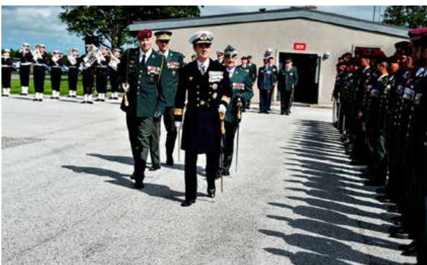
The Crown Prince inspects the parade formation during the ceremony marking the new joint command of the Special Forces at Aalborg Air Base.

The Crown Prince attended a ceremony marking the new joint command for the Special Services at Aalborg Air Base on 25 June. The Special Operations Command is an operative command that has the duty of strengthening and developing the Defence's Special Operations capacity with reference to Denmark's strategic challenges. In connection with the command ceremony, The Crown Prince inspected a parade.