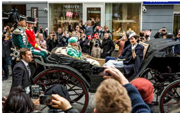
The Queen and the Crown Prince Couple rode in a carriage from Amalienborg to Copenhagen City Hall.