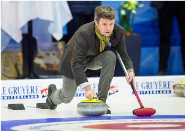
The Crown Prince threw the first ceremonial stone at the opening ceremony for the European Curling Championships 2015.