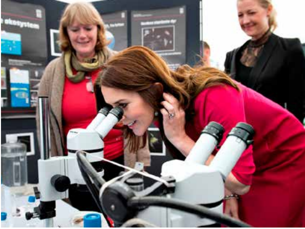
The Crown Princess saw, among other things, plankton at the opening of Forskningens Døgn.