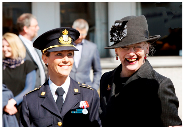
The Queen and Princess Marie took part in the Danish Emergency Management Agency's 75th jubilee reception

On 1 May, the Danish Emergency Management Agency marked its 75th jubilee with an anniversary event at the agency's headquarters in Birkerød, where The Queen and Princess Marie participated together with defence minister Nick Hækkerup. During the visit, The Queen and Princess Marie were shown the Danish Emergency Management Agency's equipment used for handling catastrophes.