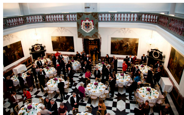
The Queen and The Prince Consort invited guests to supper in the Dome Hall after the concert.

As patron of the Danish Heart Foundation, The Crown Princess visited the day care centre "Koglehuset" in Holstebro on 3 October to start the new health project "From Knowledge to Habits" and present the Children's Heart