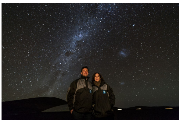
During the visit in Chile, the Crown Prince Couple paid a visit to the European Southern Observatory, Paranal, in Chile's desert area.

With the primary focus on the Danish business community's activities in a number of key sectors such as foodstuff, health, the oil and gas industry and sustainable energy solutions, Prince Joachim participated in a 4-day business and culture promotional campaign in The United Arab Emirates from 25 February. The Prince took part in, among other things, the opening of the food products fair "Gulfood" in Dubai with representatives from Danish companies. During his visit in Abu Dhabi, Prince Joachim paid a number of cultural visits and met with representatives from larger Danish companies in the region.