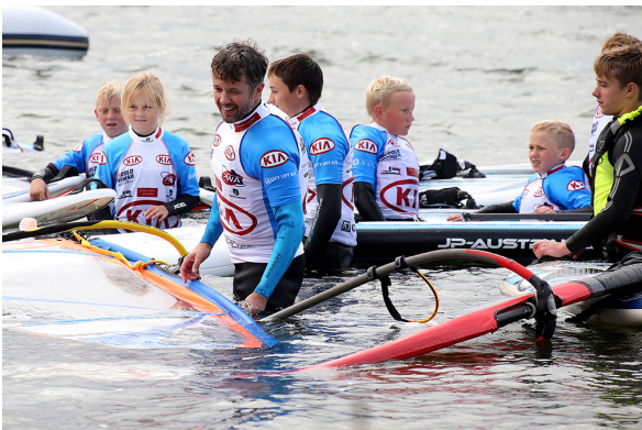
In connection with the visit in Klitmøller, The Crown Prince competed against 10 young local surfers in a sailing race.

On 2 May, The Prince Consort visited the "Red Cross"