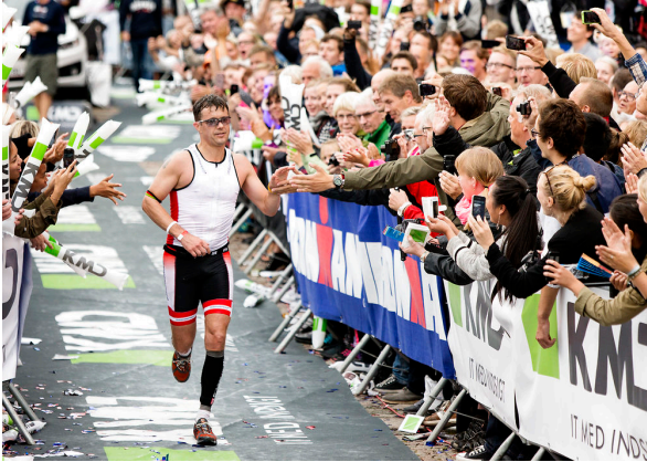
On Sunday, 18 August, The Crown Prince took part in "KMD IRONMAN Copenhagen 2013".