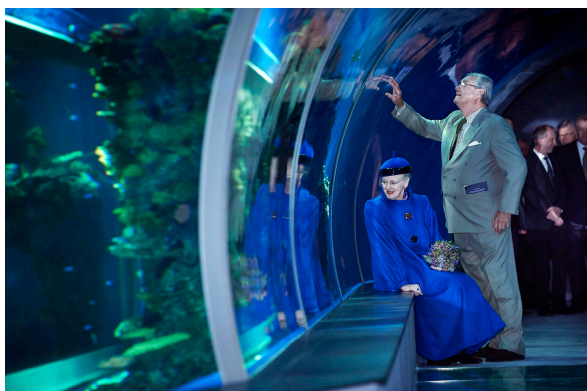
The Queen and The Prince Consort participated in the opening of the new National Aquarium Denmark, "The

Together with The Crown Prince, The Crown Princess on 17 September participated in the introduction of The Mary Foundation's project "Klubfidusen" at Bagsværd Football Club, which through specific training will strengthen children's sense of well-being in the Danish football clubs. "Klubfidusen" is based on the experiences The Mary Foundation and Save the Children have had in connection with the project Free of Bullying and was tried out at five football clubs during autumn 2013.