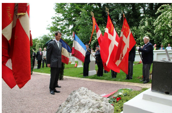
Prince Joachim participated in the reconsecration of The North Schleswig Graveyard in Braine, France.

On 5 October, The Queen and The Prince Consort also took part in the opening of the M/S Maritime Museum of Denmark