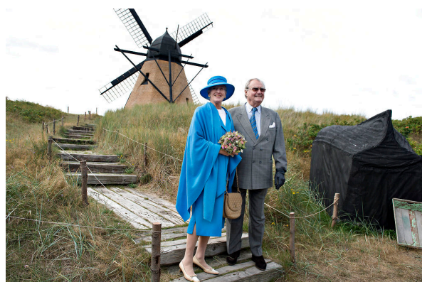
In connection with The Queen and The Prince Consort's summer cruise in September, HM The Queen and HRH The Prince Consort visited Skagen on Monday, 2 September.

The Queen and The Prince Consort carried out two summer cruises with the Royal Yacht Dannebrog around in the country. The Queen and The Prince Consort started the first summer cruise on Orø on 3 June, followed by Kerteminde, Bogense, Aarø and finally Haderslev on 7 June. The second summer cruise took place 2-6 September, when The Queen and The Prince Consort visited Skagen, Læsø, Vordingborg and Møn. During that cruise, The Queen and The Prince Consort also participated in the opening of the Anholt Offshore Wind Farm.