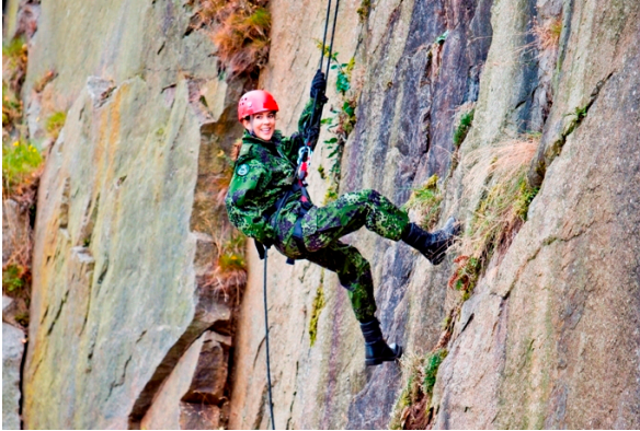
On 13 September, The Crown Princess took part in the Home Guard's exercise "Sikker Solskin" on Bornholm.