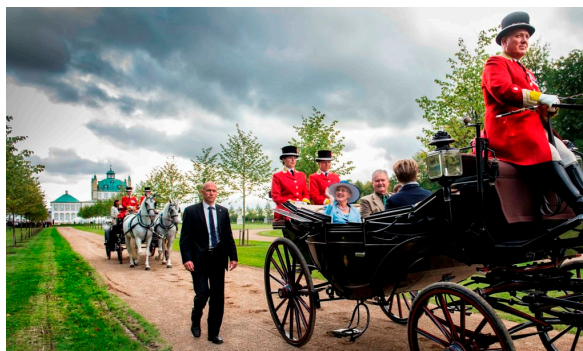
The Queen and The Prince Consort inspected the recreated Baroque grounds in Fredensborg Palace