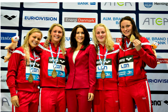
The Crown Princess presented gold medals to the Danish team at the European Championships in short-course swimming on 12 December 2013.

In September 2013, The Crown Princess became the patron of Healthcare DENMARK, which has the purpose of being an international display window for the Danish healthcare sector and Danish healthcare companies. In this role, The