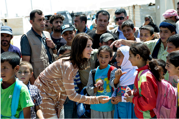
In connection with the visit in Jordan, The Crown Princess visited a refugee camp for Syrian refugees.