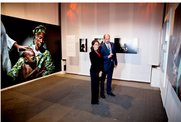
Princess Marie viewed the exhibition “Access To Life”.

The Crown Prince Couple have, for several years, been engaged in “Danmarks Indsamling” (“Denmark’s Collection”), by visiting the call centre in the TV studio on the evening of the collection. In 2013, the couple chose to divide