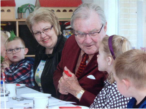
The Prince Consort at the "Red Cross" Kindergarten in Fjenneslev on Thursday, 2 May 2013.