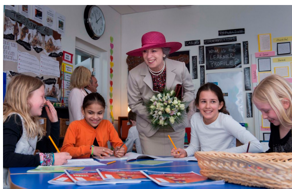
Princess Benedikte visited Copenhagen International School on Wednesday, 24 April, on the occasion of the school's 50th jubilee.

On 2 September, Princess Marie opened the new student union in Odense and afterwards took part in an event for international university students. Earlier in the year, on 13 August, Princess Marie visited H.C. Andersen Children's Hospital and was introduced to a portion of the research that goes on at the children's hospital in cooperation with the University of Southern Denmark and Odense University Hospital.