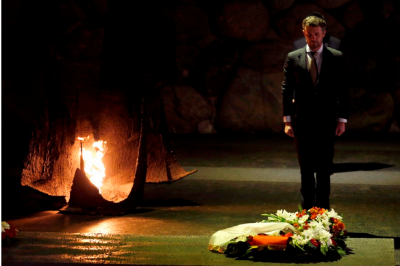
HRH The Crown Prince paid a visit in Jerusalem, Israel on 30 October 2013.