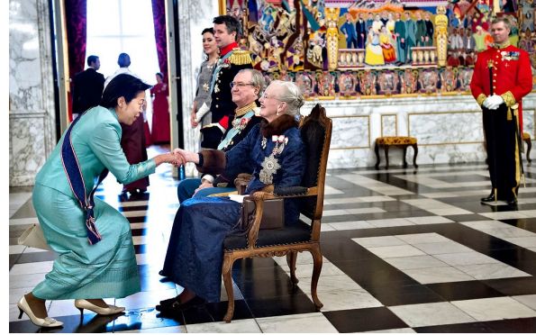
On Thursday, 3 January, The Queen and The Prince Consort held a New Year's levee for the diplomatic corps at Christiansborg Palace.

The Queen received a total of 38 foreign ambassadors who present their credentials, enabling them to work as ambassadors in Denmark. In addition, The Queen received a number of foreign heads of state and political leaders in audience, among them the parliament speaker from Indonesia, the British defence chief and the prime ministers of France, Ethiopia and South Korea.