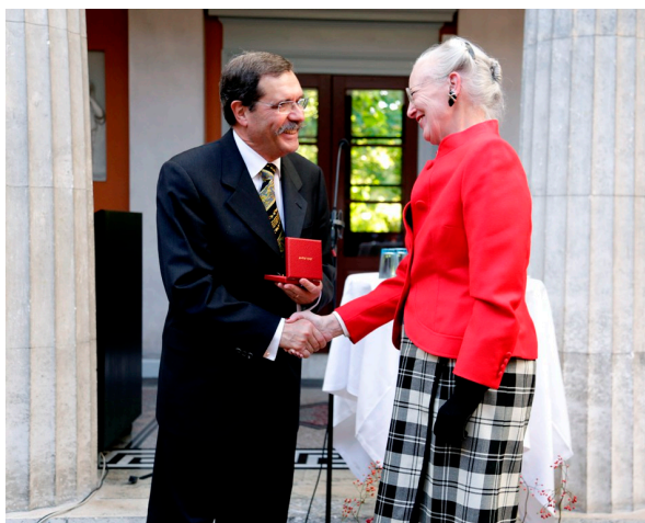
The Queen presented the Niels Bohr Gold Medal to the French physicist Professor Alain Aspect, on Monday, 7 October 2013.

Prince Joachim is the patron of "Unge Forskere" ("Young Scientists"), the scientific talent competition for students from Danish elementary and high schools and out-of-school educational institutions throughout Denmark, and he took