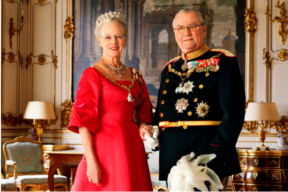
HM The Queen and HRH The Prince Consort