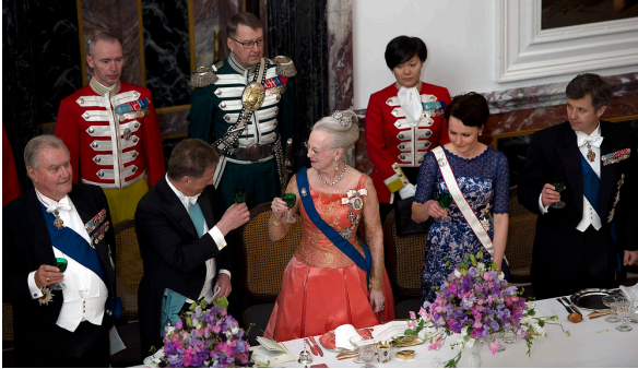
In connection with the state visit, The Queen and The Prince Consort were hosts at a gala banquet at Fredensborg Palace in honour of Finland's presidential couple.