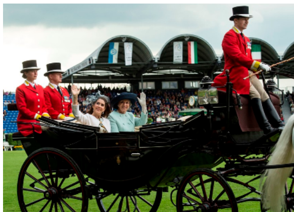
HRH The Crown Princess and HRH Princess Benedikte took part in the opening show at "CHIO Aachen 2013".