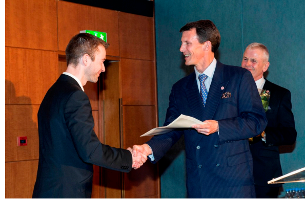
In his role as patron, Prince Joachim presented The Danish Diabetes Association’s Research Grants on 7