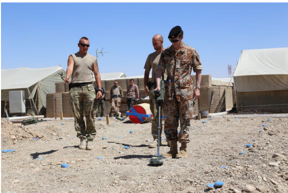
Prince Joachim visited Danish soldiers in Afghanistan from 27-31 May.

On 7 May, Prince Joachim visited the Home Guard's guard division in Kosovo and there presented NATO's Mission Medal to the volunteer Home Guard soldiers. The guard division is trained by the Home Guard and sent out by the