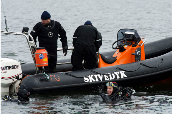
The Crown Prince led the opening of Salling Aqua Park on 16 May.