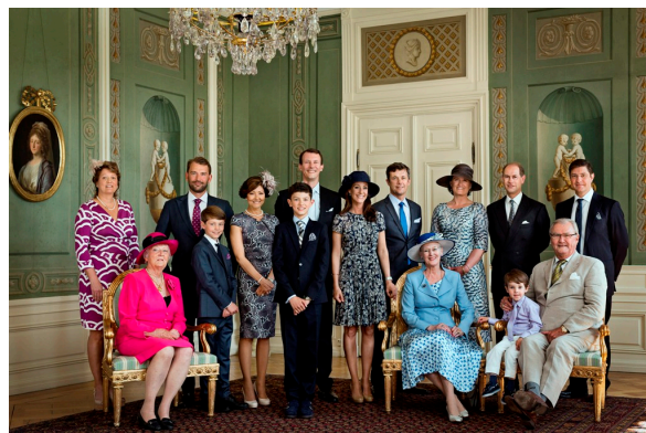
Official photographing in the Harsdorff Hall, Fredensborg Palace, in connection with Prince Nikolai's confirmation.

Moreover, the 40th jubilee of the Opera House brought into focus new generations and talents by way of a number of cultural events participated in by Danish and Australian artists, architects and designers. On this occasion, the Crown Prince Couple visited the Danish design exhibition "Danish Design at the House" and the international architecture symposium "Architecture Makes the City" in the Sydney Opera House.